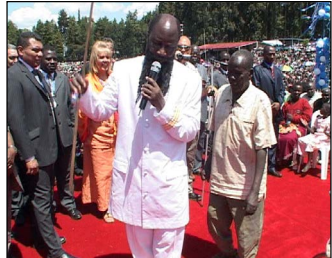
MEGA KERICHO REVIVAL 2011/ Totally Blind Eyes Open

highly exalted the glorious garment of resurrection into an exhaustless theme, and especially today when the return of the Messiah has now drawn extremely near. This garment of resurrection has become the song to which THE LORD is drawing the hearts of men to chorus, as the midnight hour ticks in. With tender regard for the fears of their human weakness, at that grave site, the LORD had given them time to become accustomed to the divine radiance of HIS glorious resurrection garment. For their cause alone, HE ushered that garment of triumph into the life story of the church. It indeed became the masterpiece of the church's hymn!