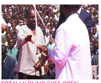
TOTALLY BLIND EYES OPEN

this noble task of knitting forth the rightful acceptable garment for the priesthood to appear before HIS Throne. And yet we also see that in the garden of Eden, the LORD already showed us the way to the Cross and the Blood as the only sacrifice that can adorn and cover us acceptably through the slaughter of those innocent animals that covered the nakedness of Adam and Eve. Nonetheless, when it comes to the day of the wedding of the LAMB, the bible clearly stipulates the gravity of that momentous occasion and the standards with which it will behold. And because that day stands out as the most important day in the calendar events of heaven, the LORD has urged the church to prepare well by dressing