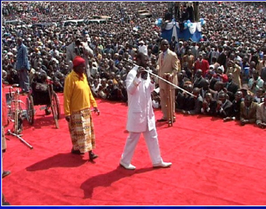
Shock as totally blind eye open and she surrenders her white cane

deliverance of the church. Moreover, in displaying to me the wounds on HIS Hands on every occasion that HE has encountered me, the LORD is principally saying that ever since Calvary, the events of that abuse on the Cross have since then not only became the eternal theme of HIS life, but also the everlasting subject in the Kingdom of GOD. It is very shocking that in this vision, I was enabled to behold for myself and the church, the MAN OF SORROWS that suffered this affliction of sin, say these painful oracles to me. Furthermore, by flashing the nail-pierced wound on HIS right Hand, the LORD wanted the church to understand that even to HIM these horrendous wounds on HIS Hands have become a source of great WONDERMENT at how life can take a turn for the worst. In so doing, the LORD was impressing on the church too, to embrace a great sense of WONDERMENT at this terrible act that happened to HIM on the Calvary Cross, so that in their worship they may adore HIM more and strike their keyboards with higher notes, and with greater joy as they remember the BATTLE HIS Hands accomplished. The wounds that the LORD spots on HIS Hands indeed highlight a sign that HE did a tremendous battle for the church with HIS Hands and incurred the expense the church herself ought to have suffered. This is the reason HE perpetually keeps reminding the church of this exorbitant cost HE incurred for her treasured salvation. In this way, HE also meant to revive the joy of the church since